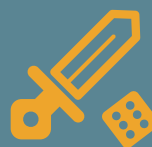
Table-top Role-playing games (RPG)